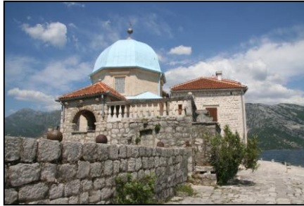
Island Monastery in Bay of Kotor