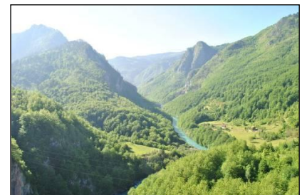
The Tara Canyon