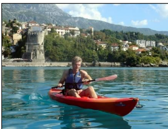
Kayaking on the Bay of Kotor