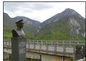
Durdevica Bridge (Tara Canyon)