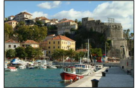
Herceg Novi Old Town