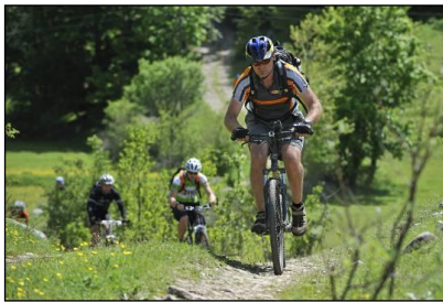
Biking & hiking trails