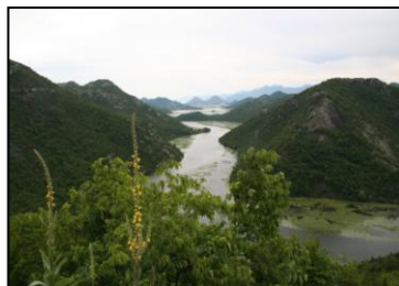
Skadar Lake National Park